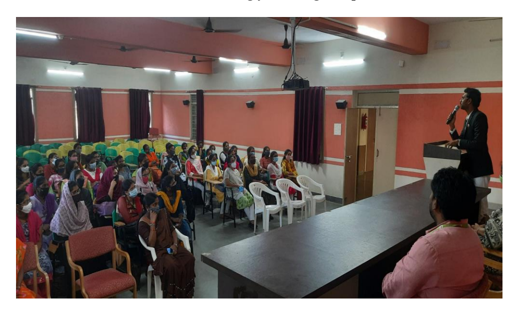
Resource person clarifying the student doubts

Finally the resource person conclude the every girl should aware the schemes to be taken by the government such as Beti Bachao Beti Padhao, Sukanya Samriddi Yojana, National Scheme of Incentive to Girls for Secondary Education. Every girl child should aware the girl rights in society. Total 44 students and faculty members attended in this program. The students gained knowledge on how to survival and protect themselves.